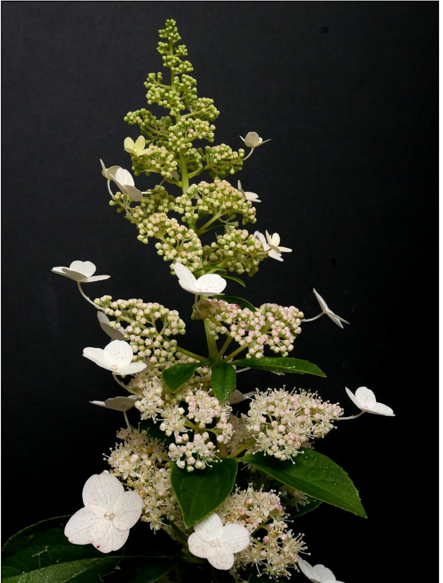
Hydrangea paniculata 'Great Escape' Acc: 801