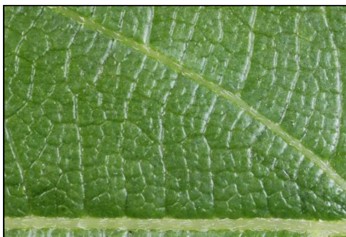
Leaf: Top Surface