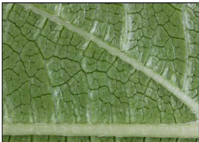
Leaf: Lower Surface