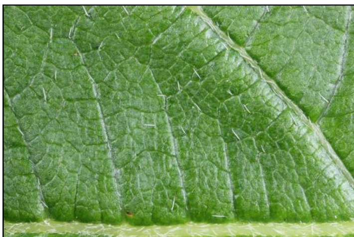
Leaf: Top Surface