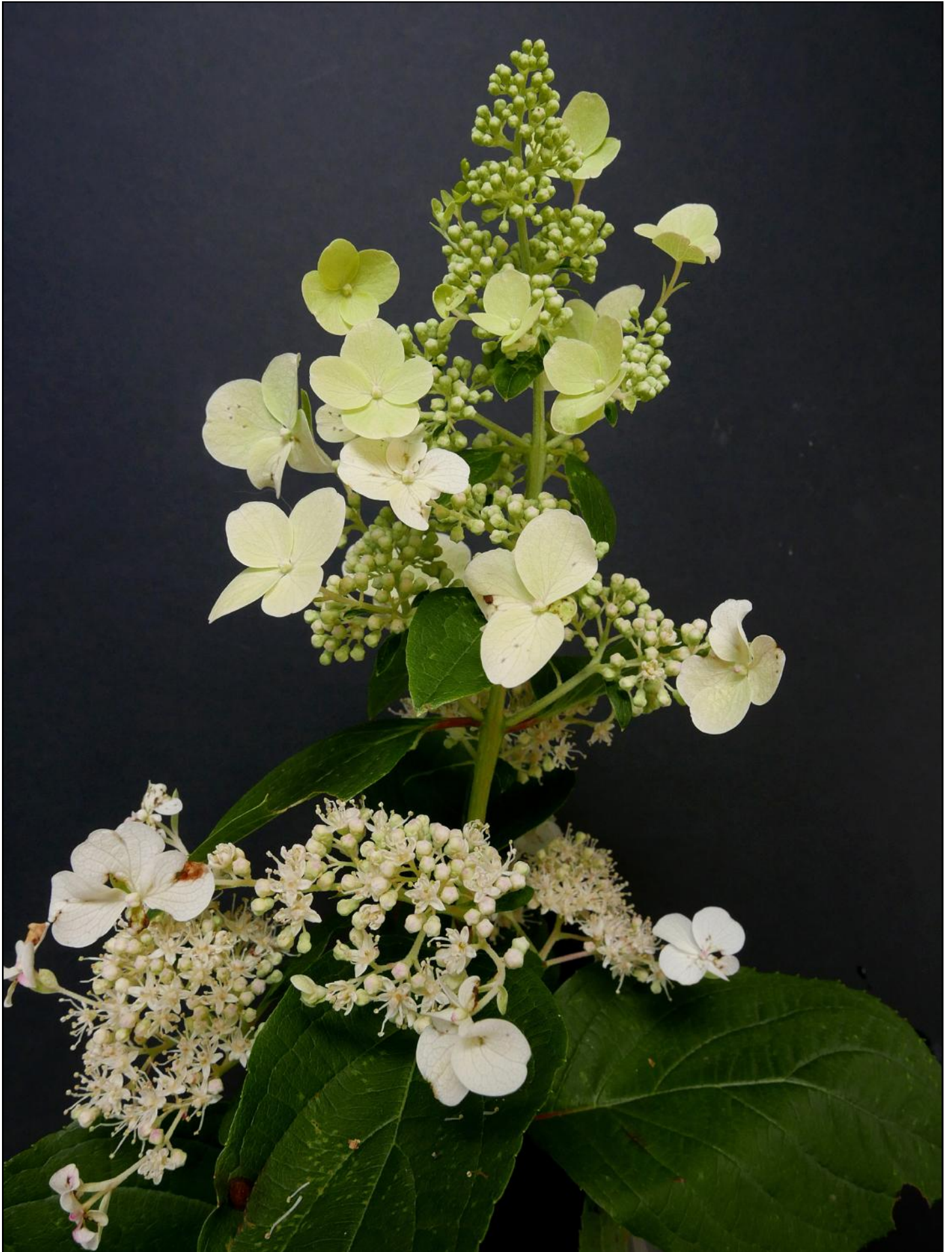
Hydrangea paniculata 'Green Spire' Acc: 228