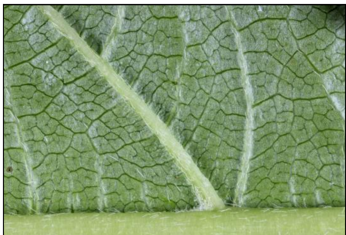
Leaf: Lower Surface