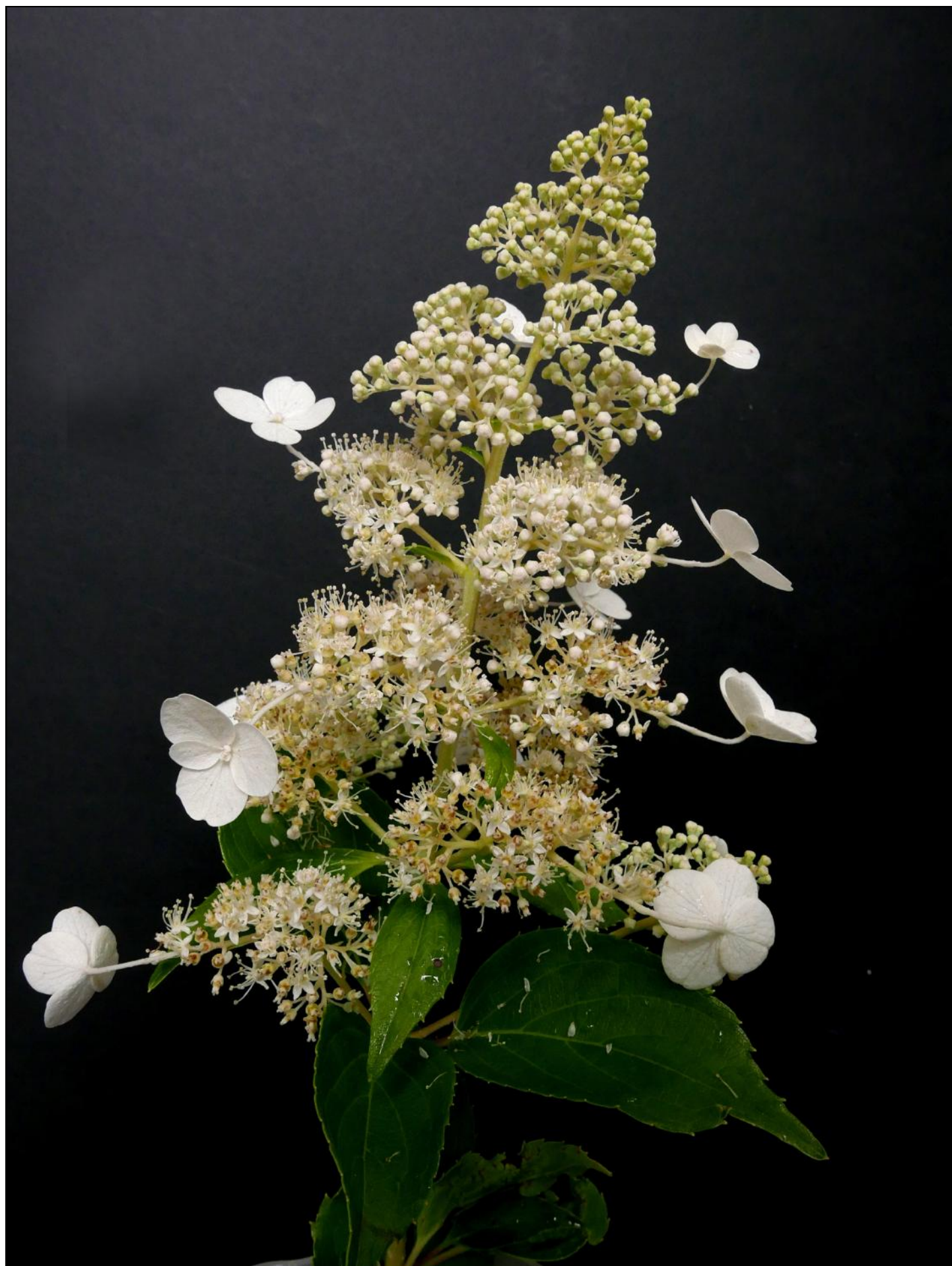
Hydrangea paniculata 'Kyushu' Acc: 289