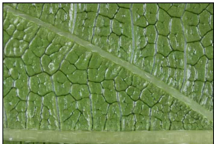
Leaf: Lower Surface