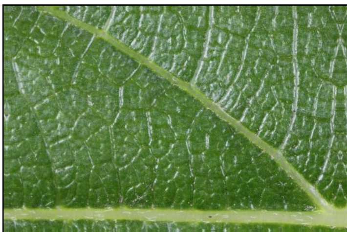
Leaf: Top Surface