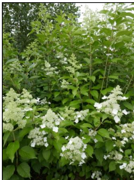
All Photo's Hydrangea Derby Acc: 289