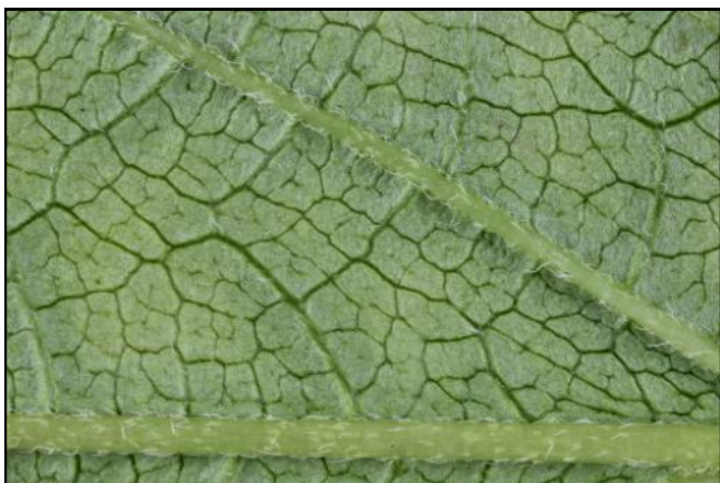
Leaf: Lower Surface