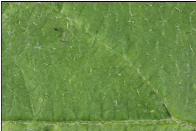
Leaf: Top Surface