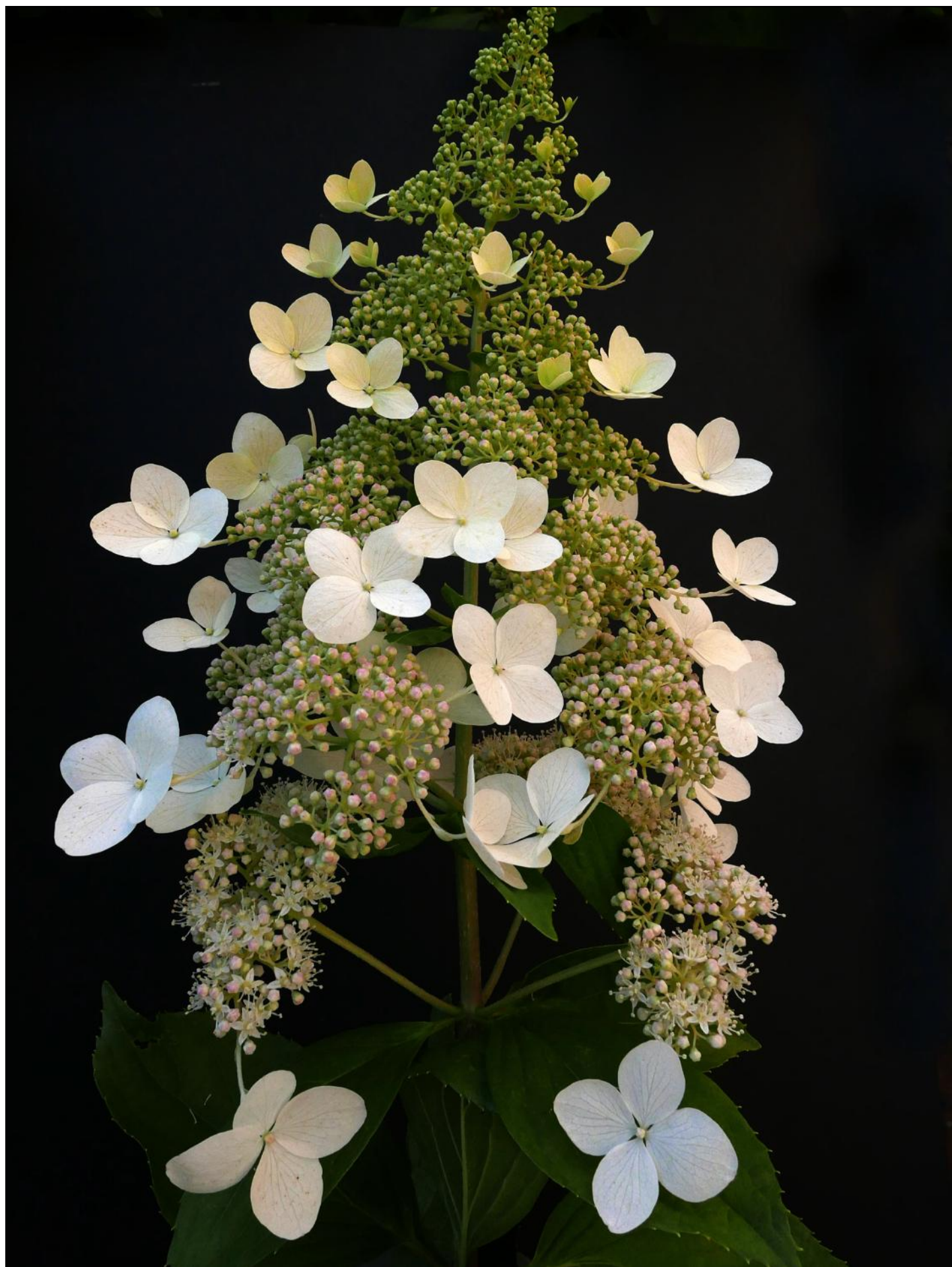
Hydrangea paniculata 'Melody' Acc: 790