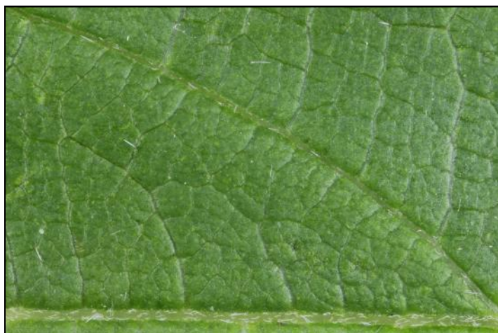
Leaf: Top Surface