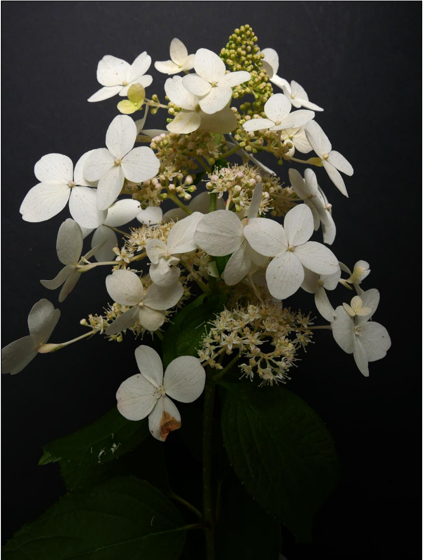
Hydrangea paniculata 'Mid Late Summer' Acc: 802