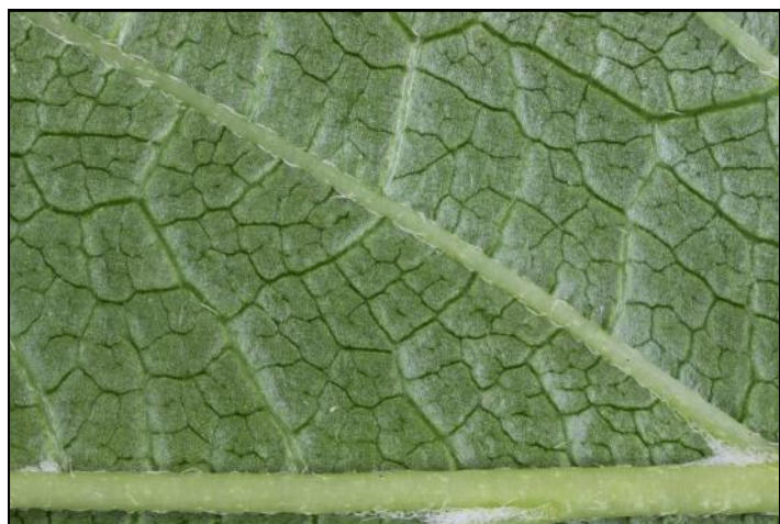
Leaf: Lower Surface