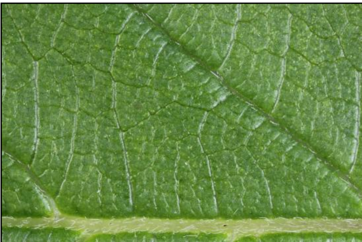
Leaf: Top Surface