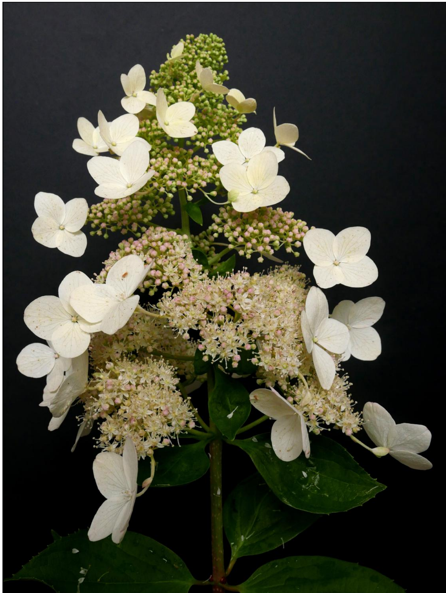
Hydrangea paniculata 'Papillon' Acc: 805