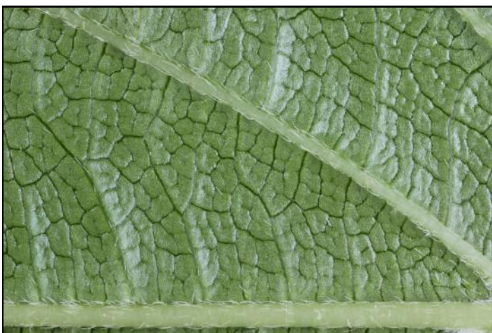
Leaf: Lower Surface