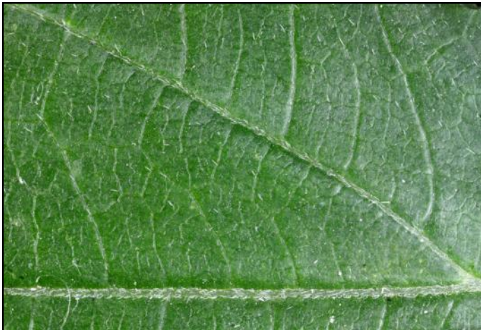
Leaf: Top Surface