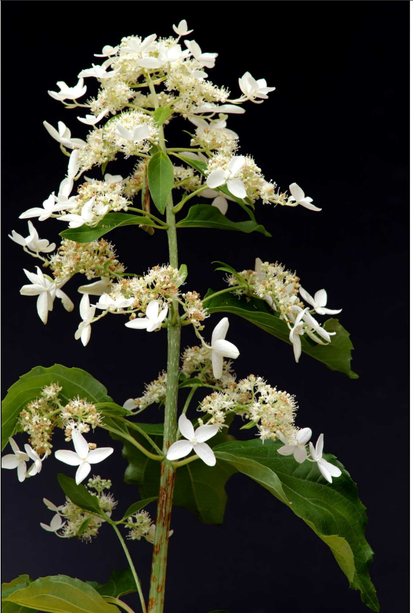
Hydrangea paniculata 'Praecox' Acc: 32