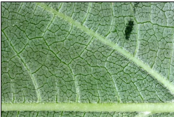
Leaf: Lower Surface