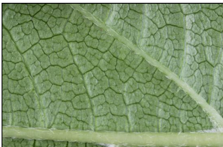
Leaf: Lower Surface