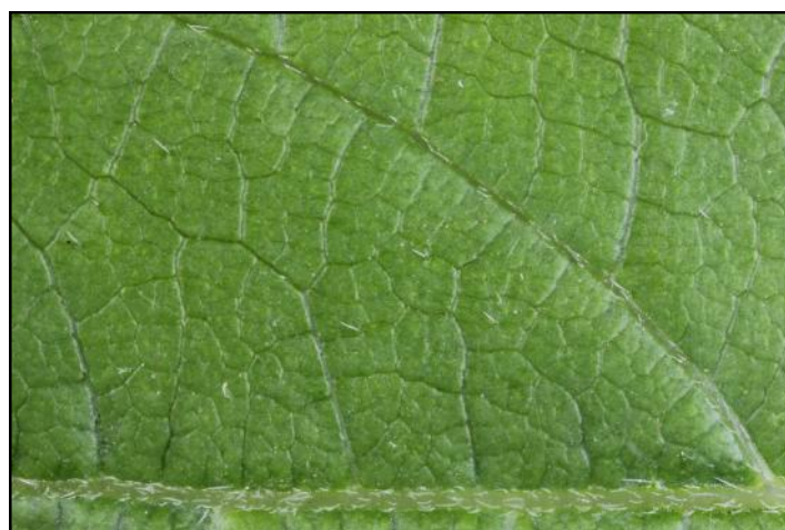
Leaf: Top Surface