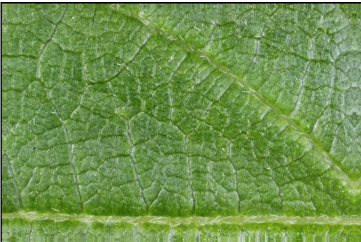
Leaf: Top Surface