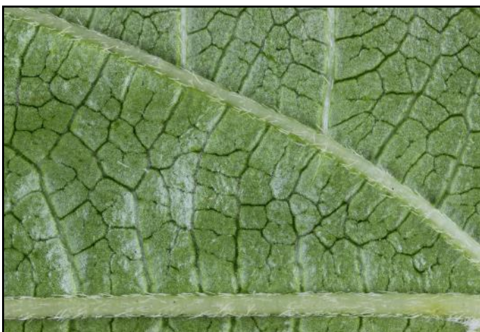
Leaf: Lower Surface