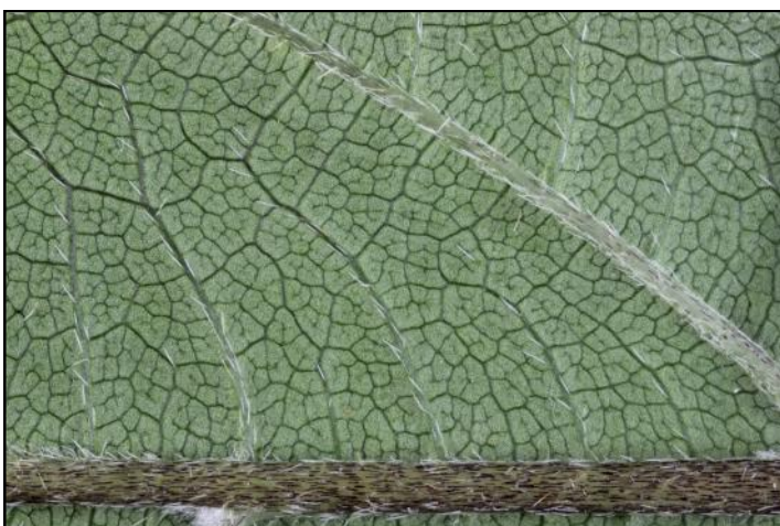
Leaf: Lower Surface