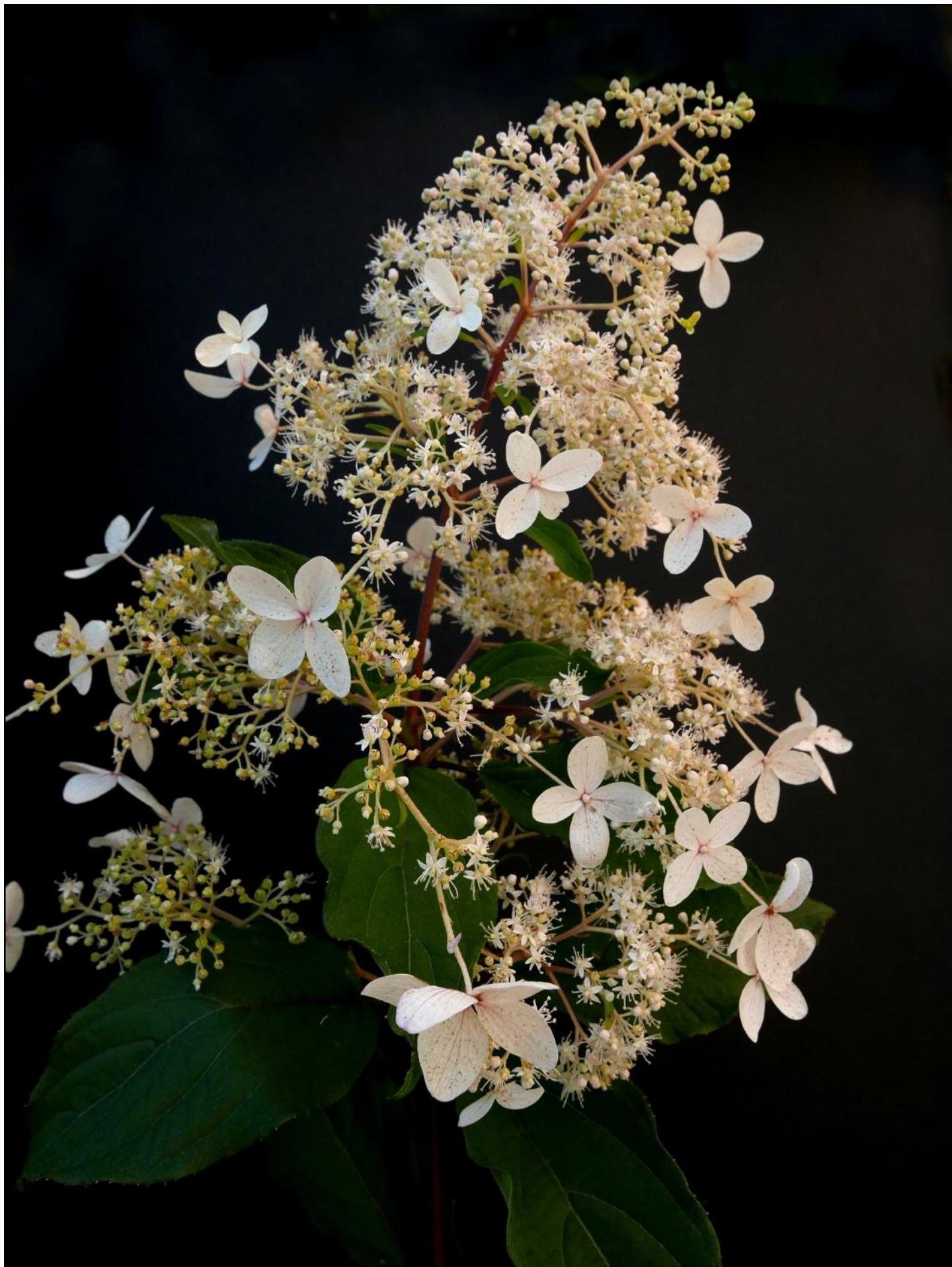
Hydrangea paniculata 'Taiwan Form' Acc: 796