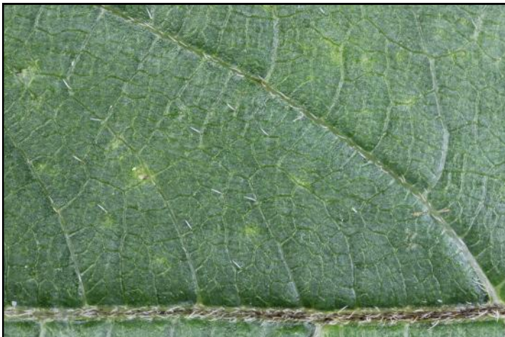
Leaf: Top Surface