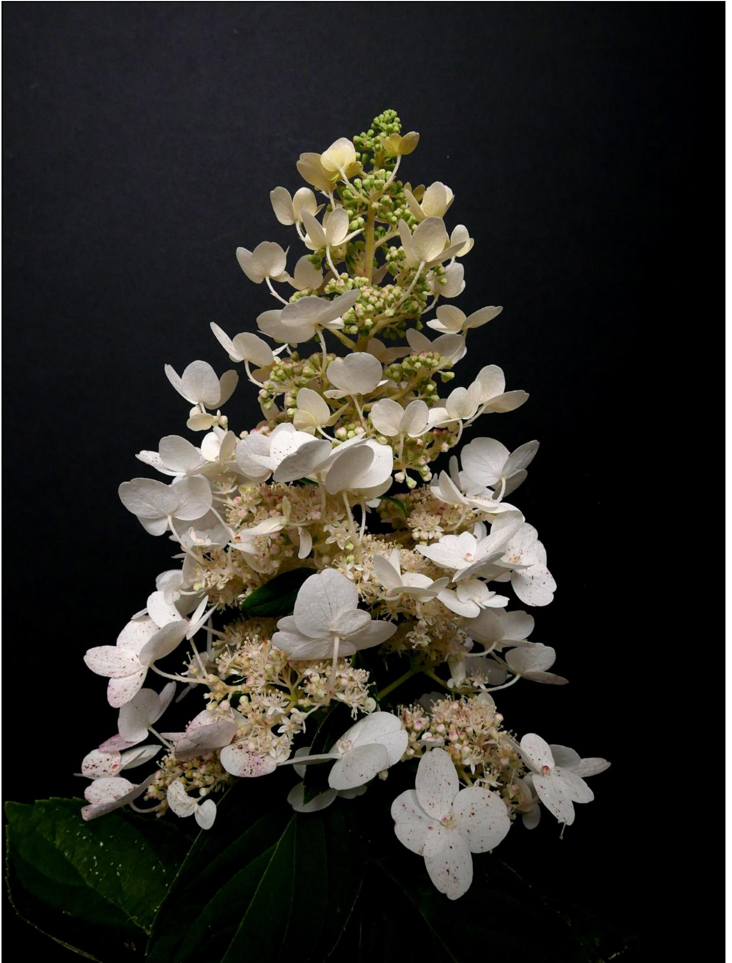
Hydrangea paniculata 'Tardiva' Acc: 376