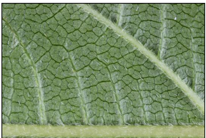
Leaf: Lower Surface