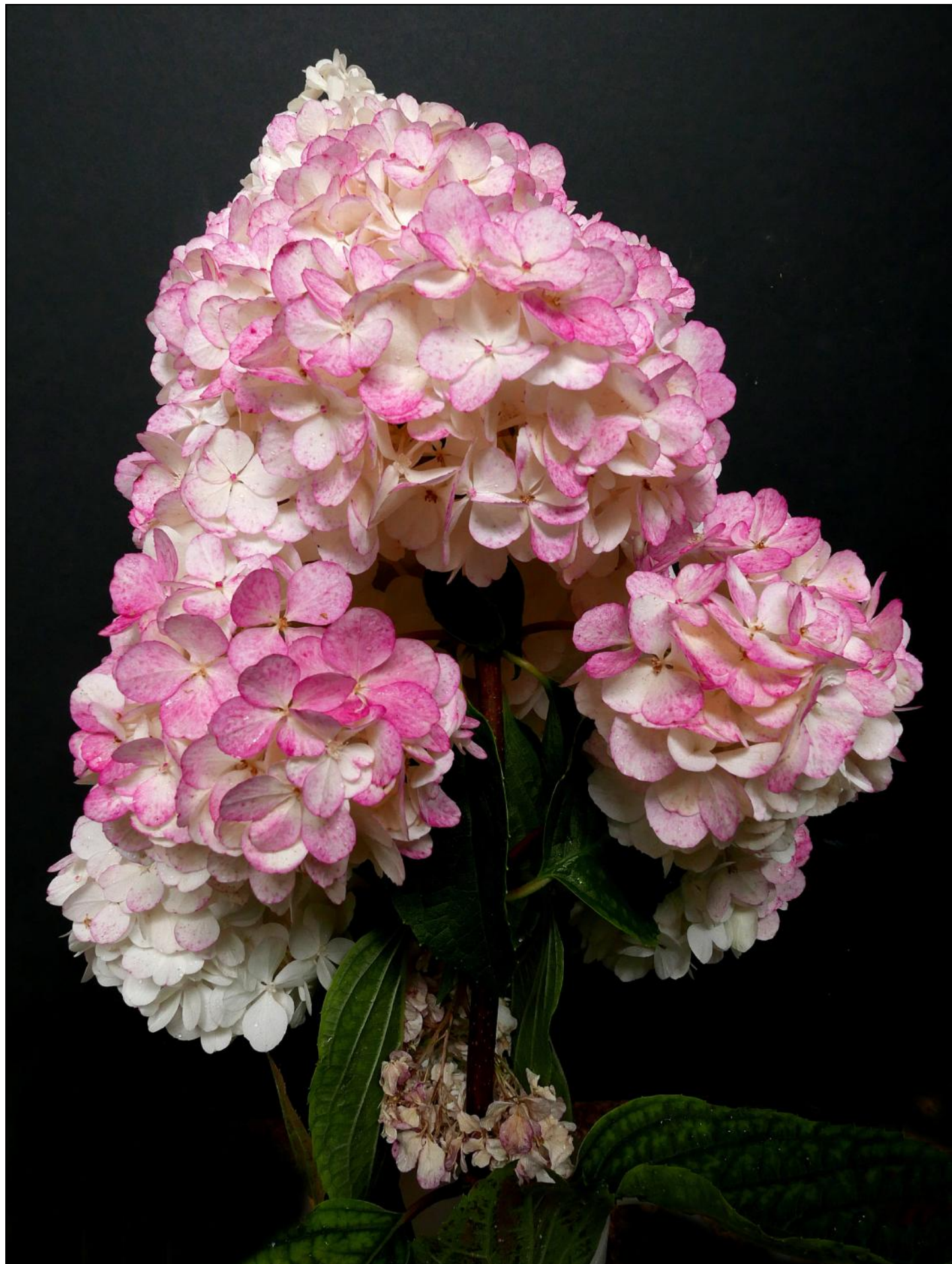
Hydrangea paniculata 'Vanille Fraise' Acc: 766