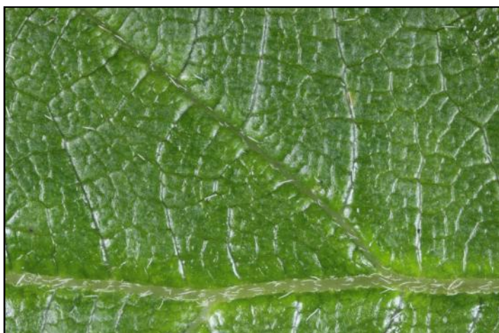
Leaf: Top Surface