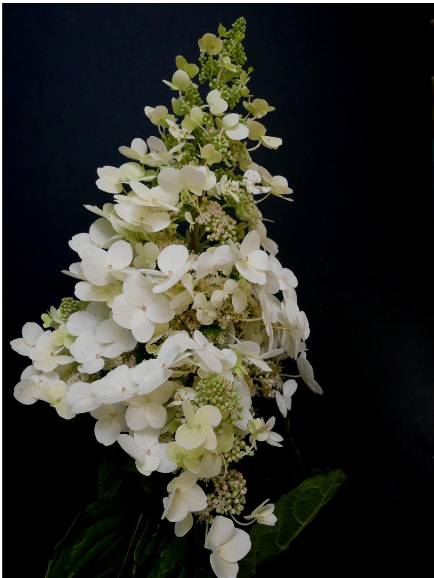
Hydrangea paniculata 'Vera' Acc: 39