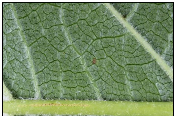
Leaf: Lower Surface