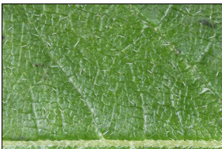
Leaf: Top Surface