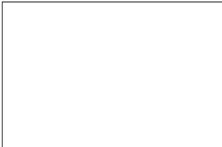
Fertile Flower - not yet photographed