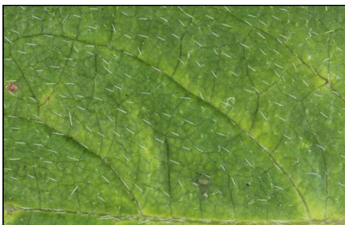
Leaf: Top Surface