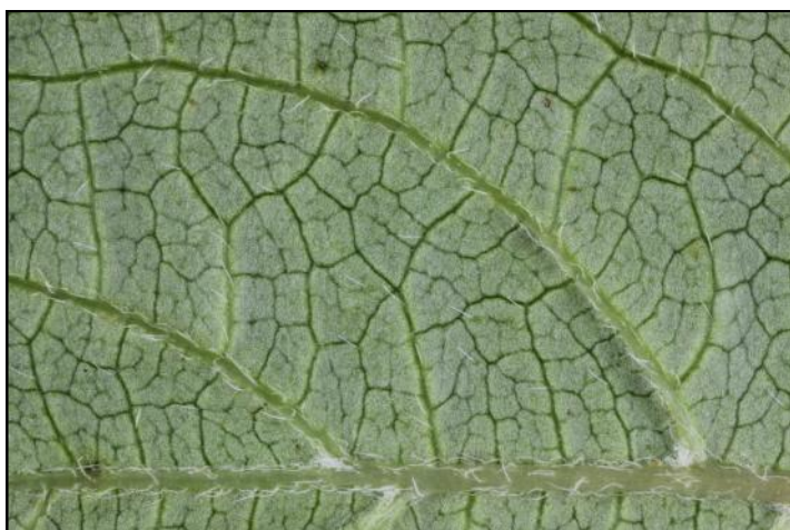
Leaf: Lower Surface