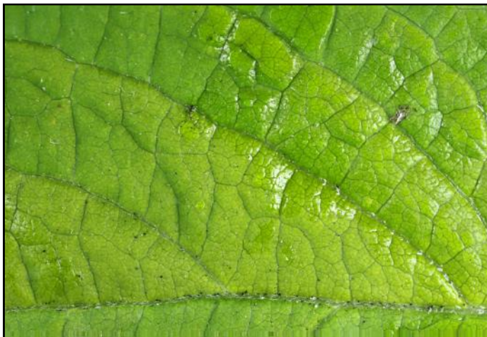
Leaf: Top Surface