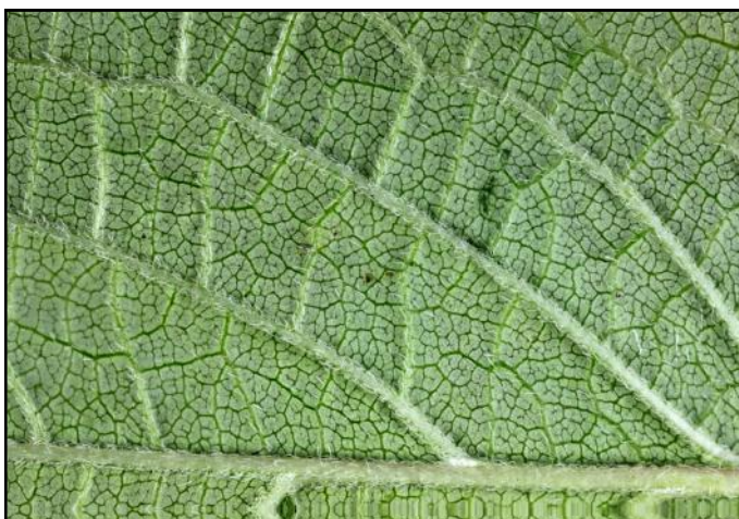
Leaf: Lower Surface