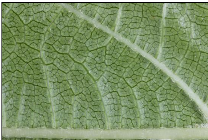
Leaf: Lower Surface