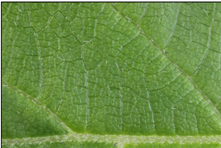
Leaf: Top Surface