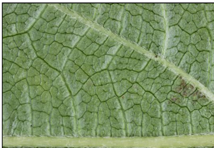
Leaf: Lower Surface