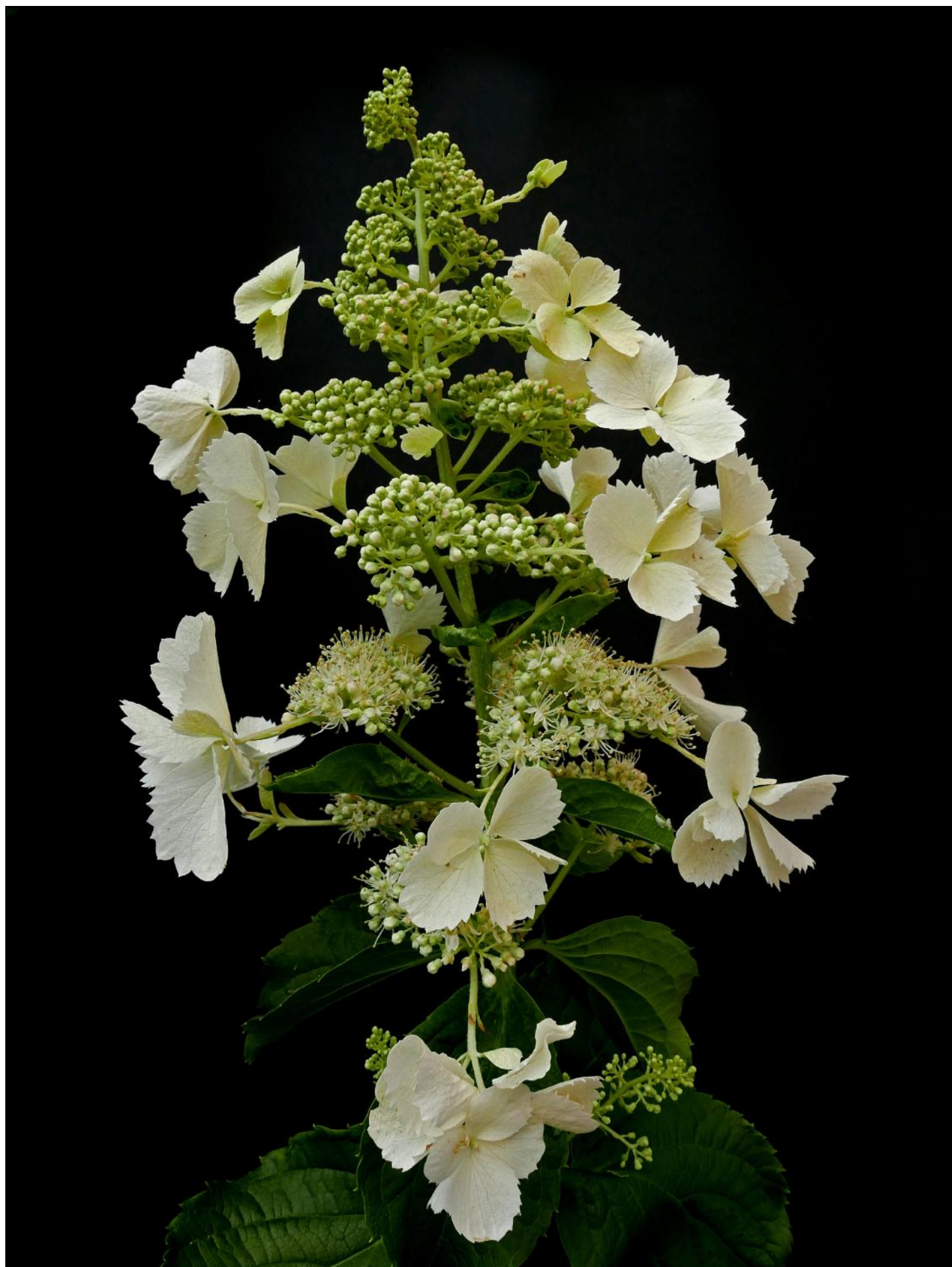
Hydrangea paniculata 'White Lady' Acc: 1213