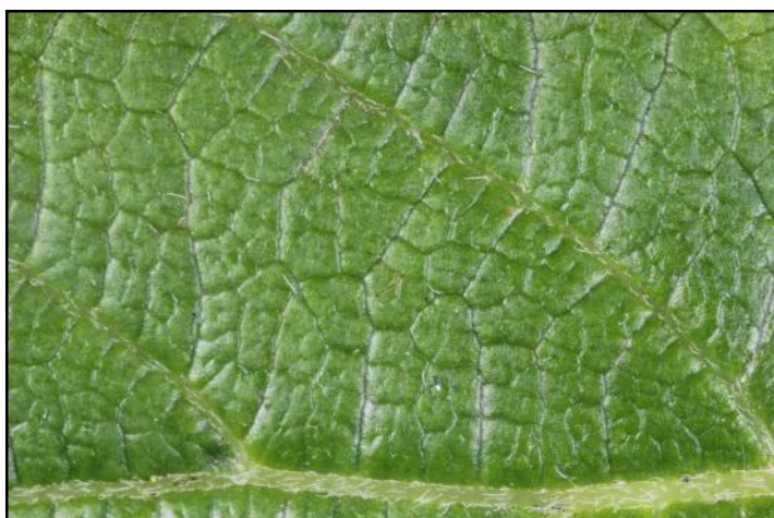
Leaf: Top Surface