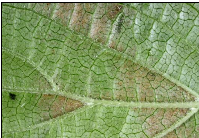
Leaf: Lower Surface