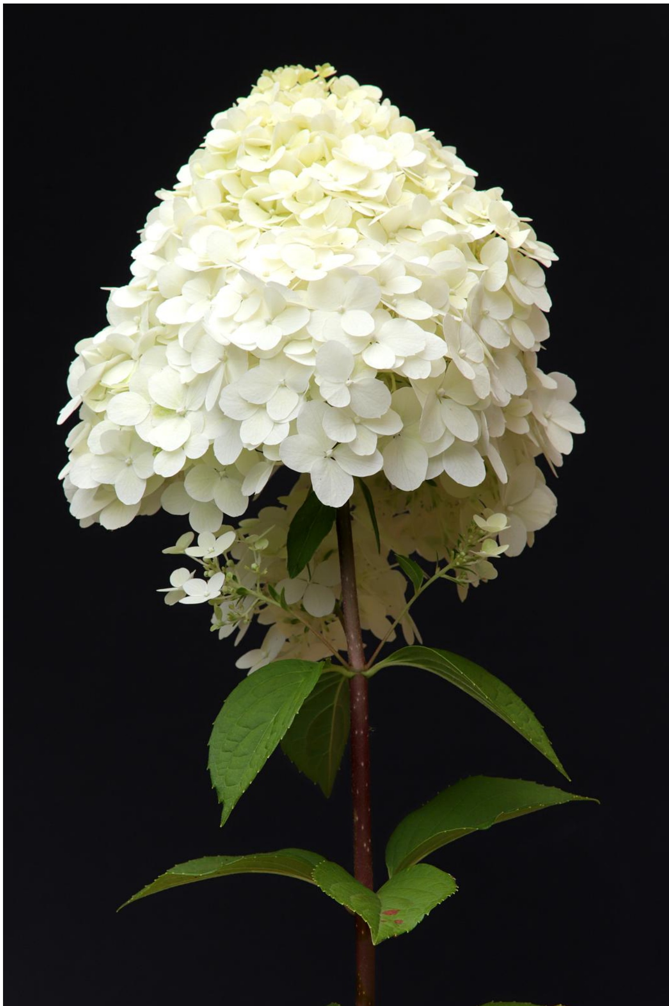
Hydrangea paniculata 'Diamantino' Acc: 1292