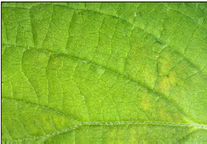
Leaf: Top Surface