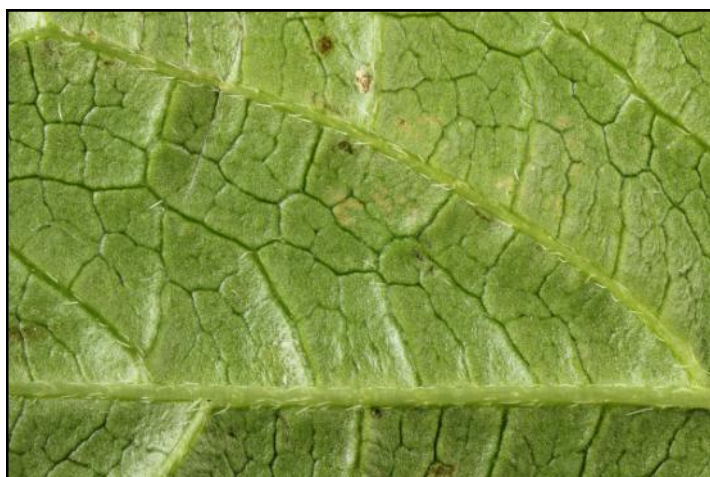
Leaf: Lower Surface