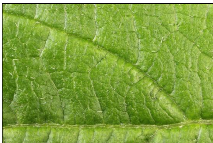
Leaf: Top Surface