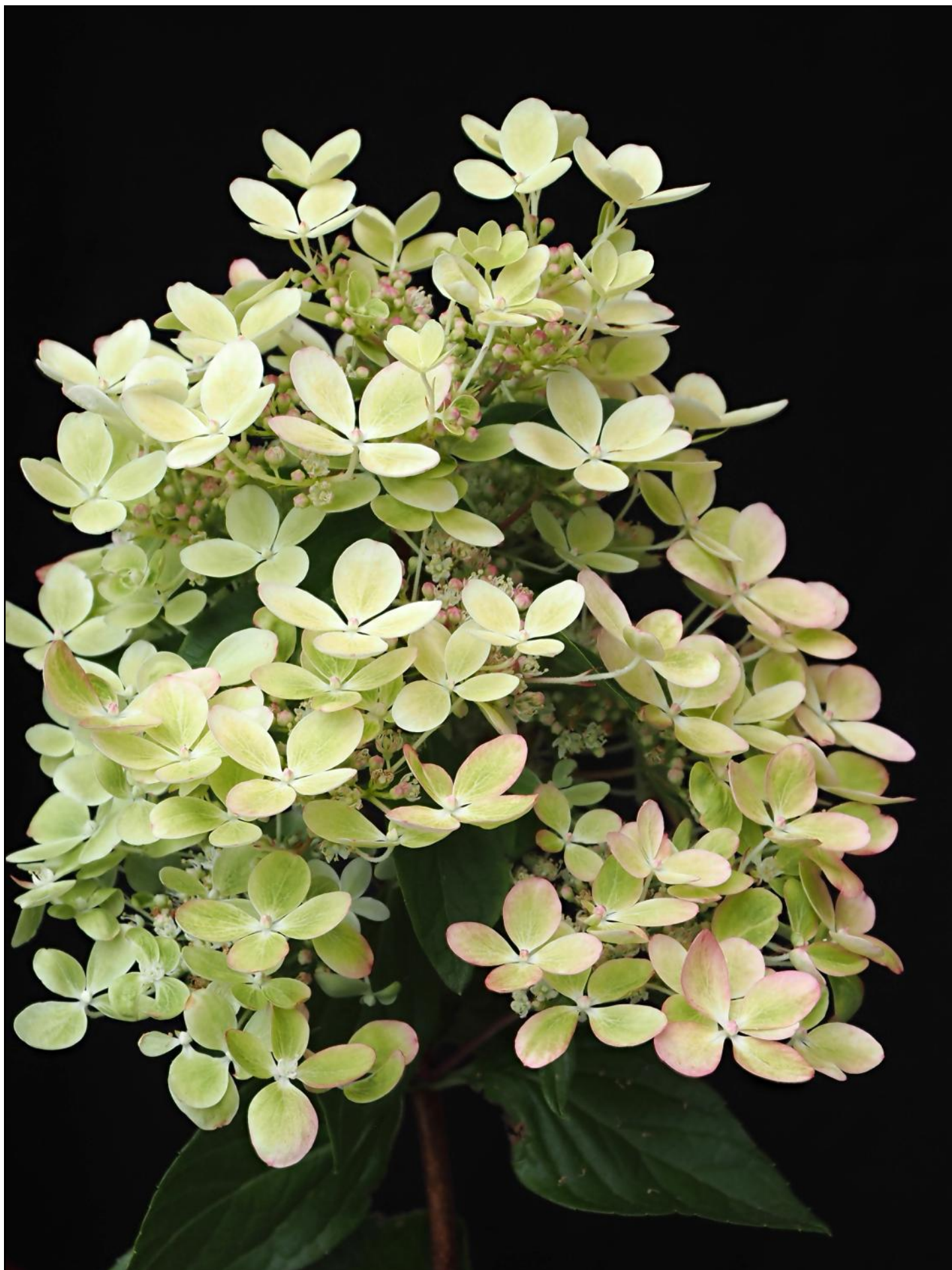
Hydrangea paniculata 'Pastel Green' Acc: 1387