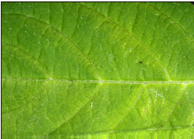
Leaf: Top Surface