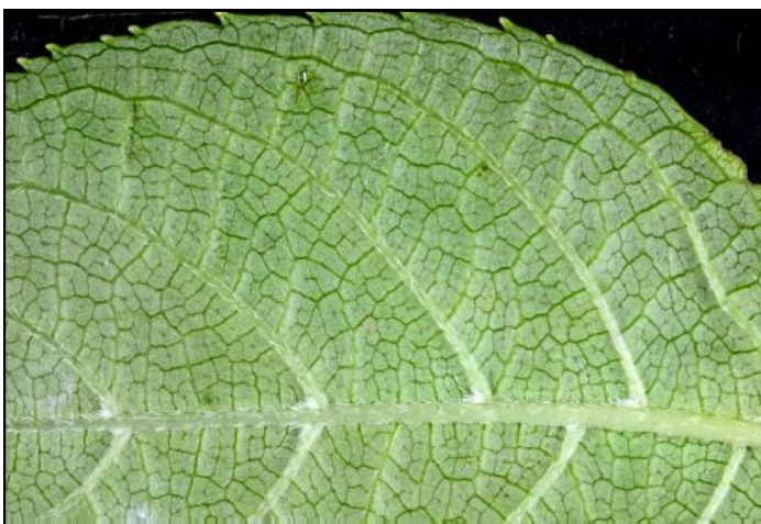
Leaf: Lower Surface