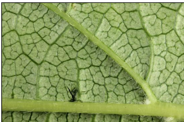
Leaf: Lower Surface