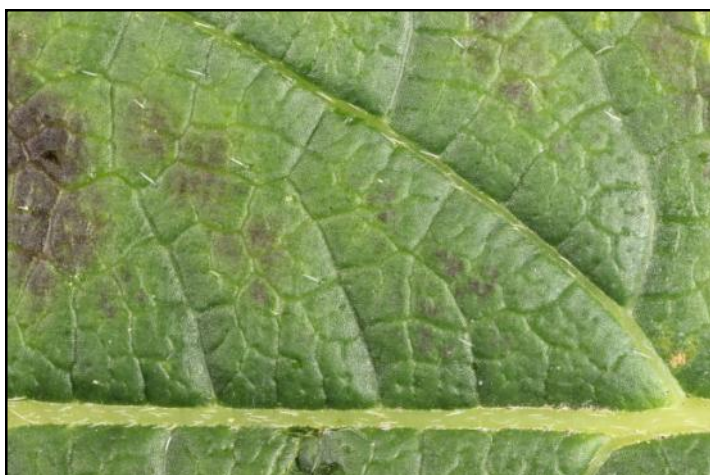
Leaf: Top Surface